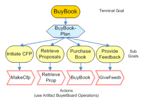
Figure 2. Buyer's goal overview.

This section discusses the usage of artifacts within the contract-net scenario introduced in Subsection 2.2. The example has been chosen in order to compare the approach with the one described in [2], in which the same scenario was used and a special 'Protocol' capability was introduced to handle message passing between agents. Whereas the Protocol capability is aimed at hiding low-level programming details to the developer, here we place the problem in terms of A&A mediated interactions and describe solution sketches using the